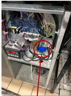
Power sensor clip