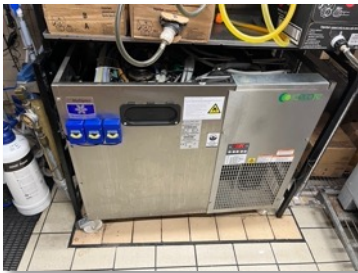
Multiplex 44 Icecore Cooler/Carbonator