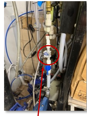
Water flow meter - Coarse Filter