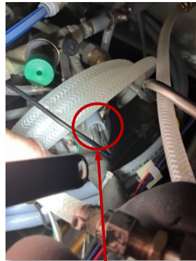
Temperature probe - Return Flow from Drinks Tower