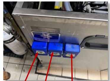
Ice Bath, Flow & Return sensors (reporting to the gateway)